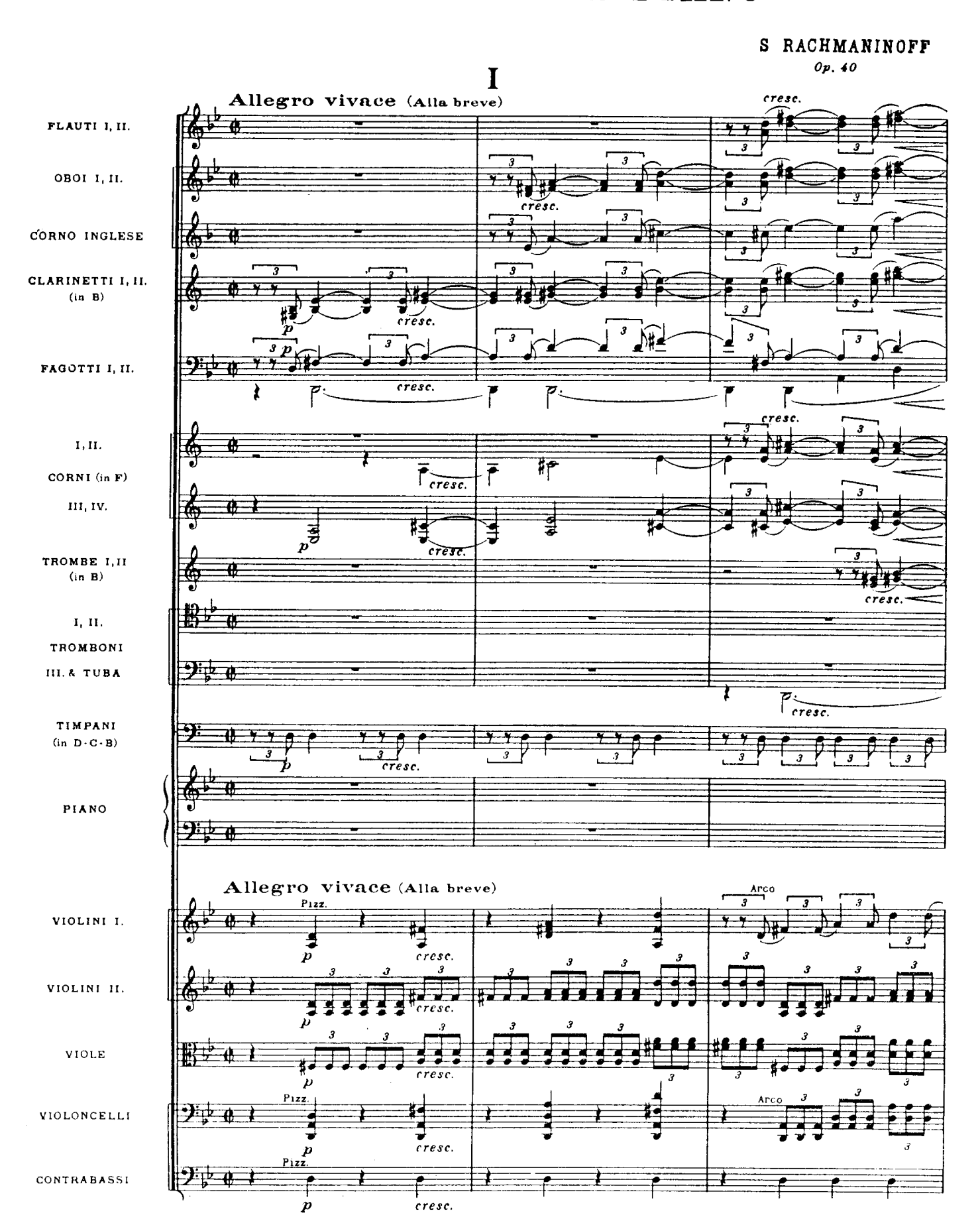
EDWIN F. KALMUS & CO., INC.